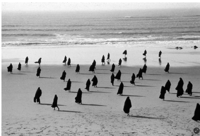
Shirin Neshat, Rapture (still), 1999. © Shirin Neshat. Photo by Larry Barns. Courtesy of Galerie Jérôme de Noirmont, Paris.