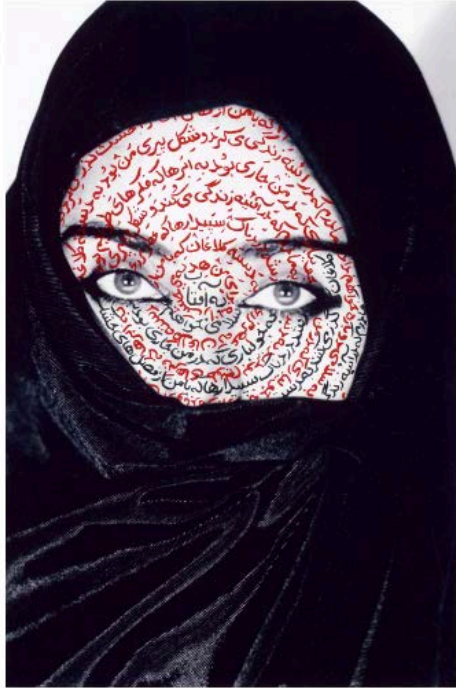
Shirin Neshat, I Am Its Secret , 1993. © Shirin Neshat. Photo by Plauto. Courtesy of the artist and Gladstone Gallery, New York and Brussels.