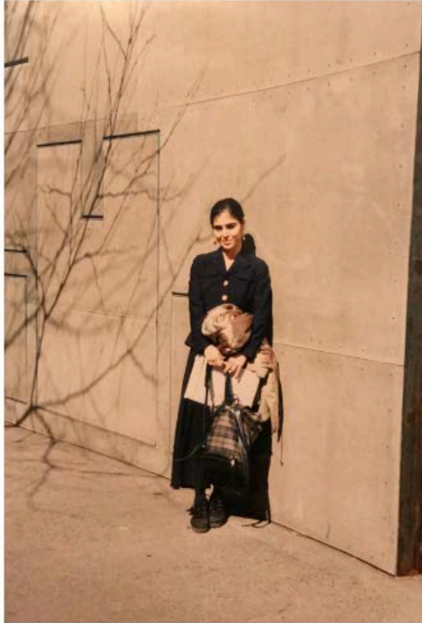
Shirin Neshat in front of the exhibition space, Storefront, in downtown Manhattan circa 1980s.

What encouraged you to get back into art?