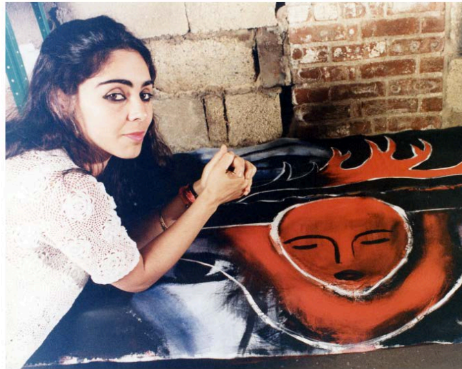
Shirin Neshat with one of her paintings circa 1980s.

It was really terrible—I destroyed evidence of all this work. Honestly, I had to be one of the weakest artists at the school. I applied to Berkeley's graduate program, and my professor told me that I just barely got in.