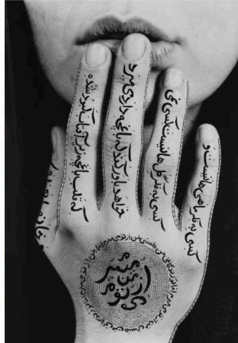
Shirin Neshat, Untitled, 1996.

There was no diplomatic relationship between the U.S. and Iran for a long time. I feared that if I went back home, I wouldn't be able to return to the states. Finally, after about 11 years, I got my American citizenship and felt confident enough to make the trip. Those travels were very moving and shocking. When I came back, I felt an urge to make something that kept this relationship alive again between me and Iran. But I knew that I needed time and space to make something.