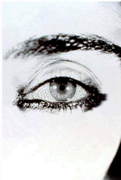
Shirin Neshat, Offered Eyes , 1993. © Shirin Neshat. Photo by Plauto. Courtesy of the artist and Gladstone Gallery, New York and Brussels.