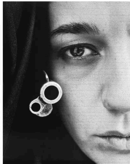
Shirin Neshat, Speechless, 1996.