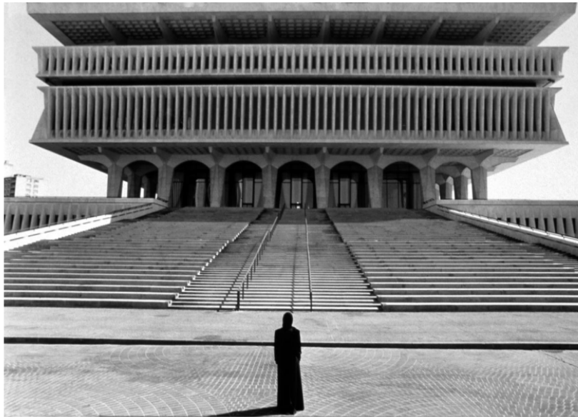
Shirin Neshat, Soliloquy Series, 1999.

In my classes in Iran, the teachers used to ask me to do murals on the blackboard or the walls. There was another strange thing, too: I used to draw women and then design clothes for them. I'd dress them up in certain ways. My cousin told me recently that when I left Iran, she took my book of my drawings. I don't know what that was about, but I had this fascination with women and dressing them up. My cousin still has that book and I haven't seen it for 40 years. Maybe I was influenced by magazines—fashion, modernity. As I discovered my own body, I became fascinated (along with the rest of my generation) with a Western look we saw in the movies, television shows, and publications. Gone with the Wind was massively popular in Iran. We watched Peyton Place and The Flying Nun . We were just mesmerized by Hollywood.