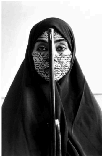
Shirin Neshat, Rebellious Silence, 1994.