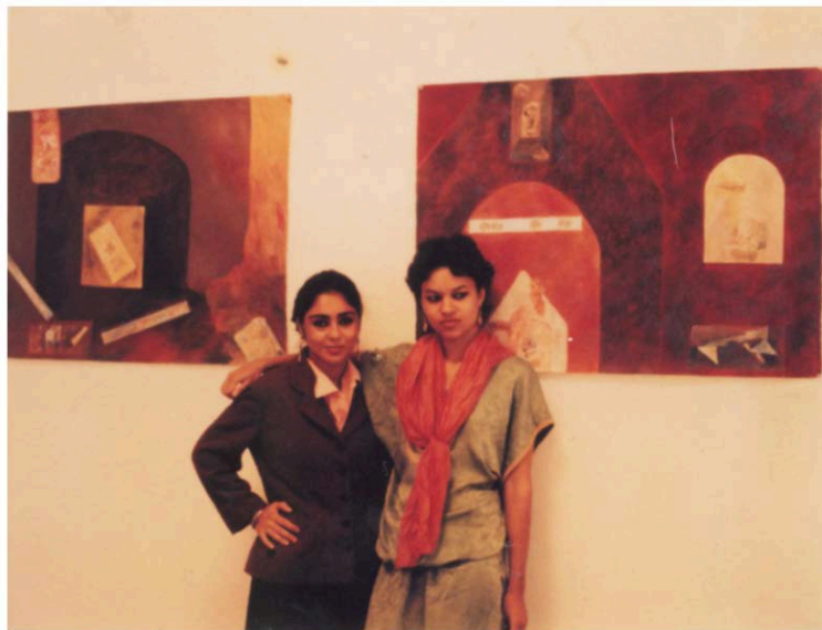
Shirin Neshat (left) at Berkeley circa 1979.

I occasionally went to Tehran, where there were pockets of cultural activities, but I didn't know anything about it. I did have a lot of interest in literature. In Iran, we studied poetry. We read a lot. That eventually became a part of my artwork, when I started writing on photographs.