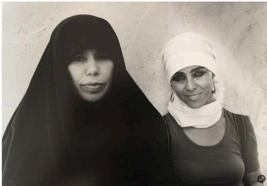
Sherin Neshat (right) with a film extra while shooting Rapture circa 2000.

Finding an identity. I'm very glad I left art when I did. There's nothing worse than mediocrity. Many of us go to school, and we're content even if the work isn't great. I needed to find what I had to say, what people should pay attention to. What makes good art? What do I want to communicate? I figured this out after my experience in Iran.