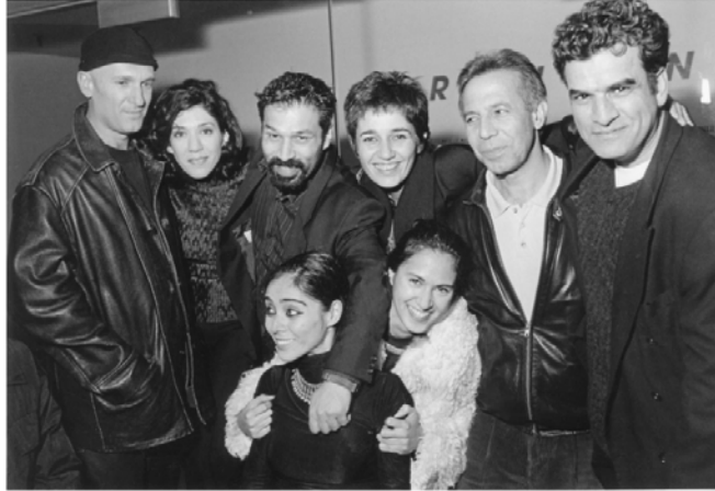
Shirin Neshat (center, left) at the opening of her exhibition "Turbulent" at the Whitney Museum in 1998.